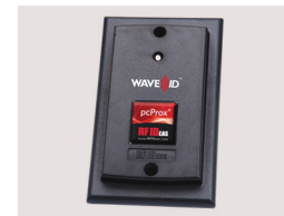
Wall Mount Reader