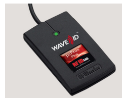
pcProx Plus 82 Series Desktop Reader