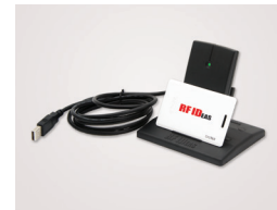
Mounted Desktop Reader