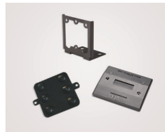
Optional Mounting Brackets